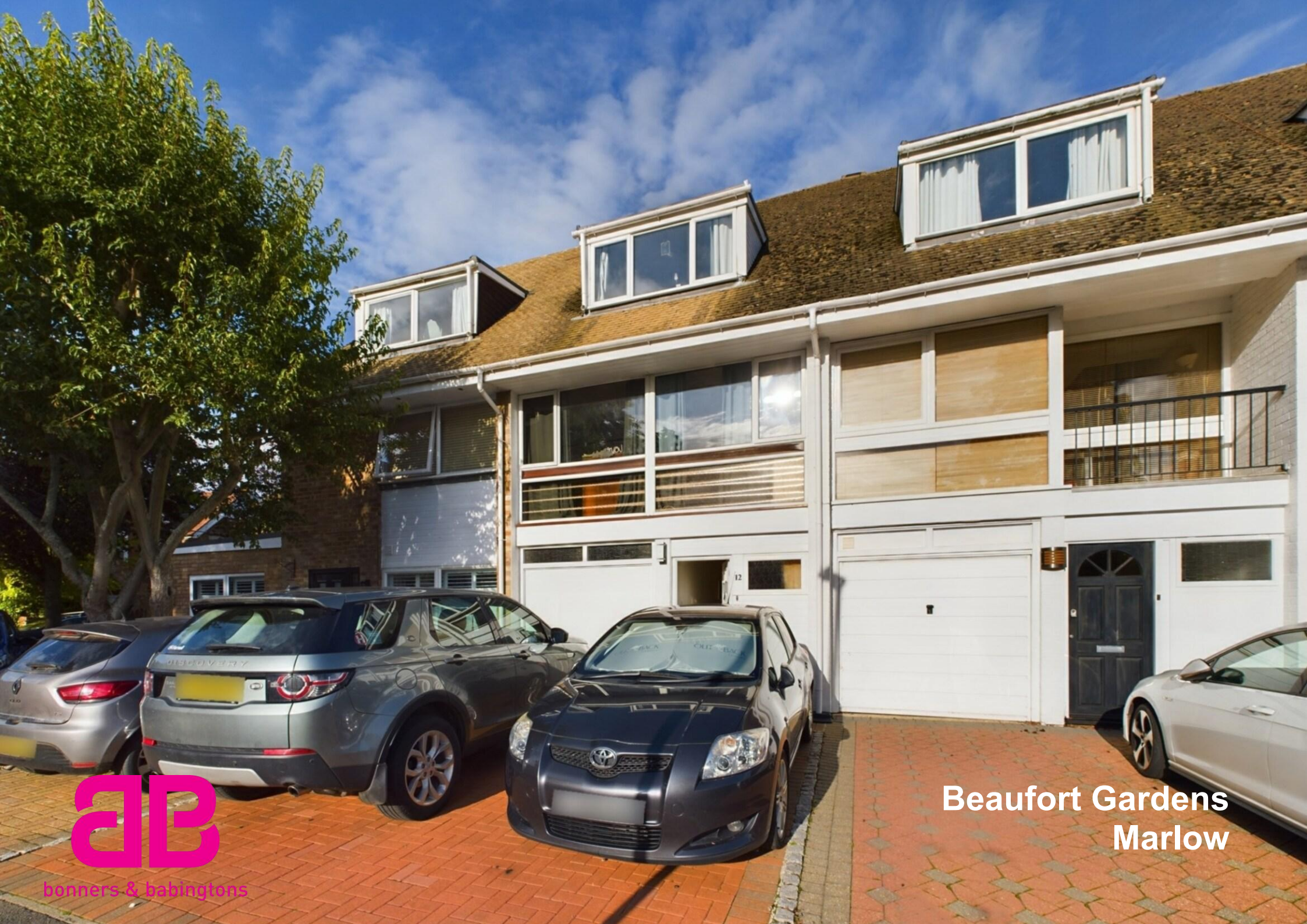
Beaufort Gardens Marlow