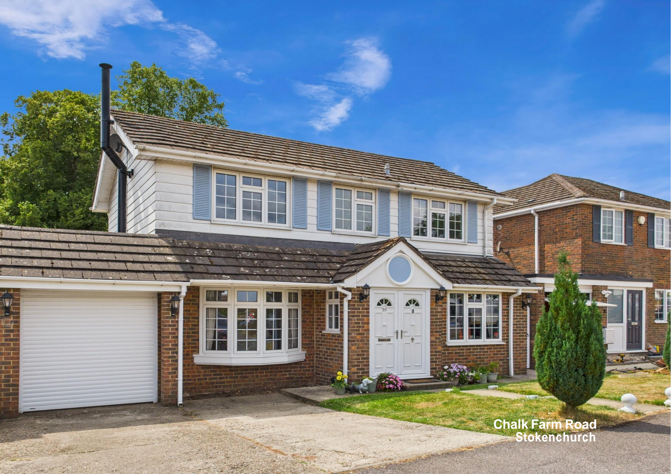
Chalk Farm Road Stokenchurch