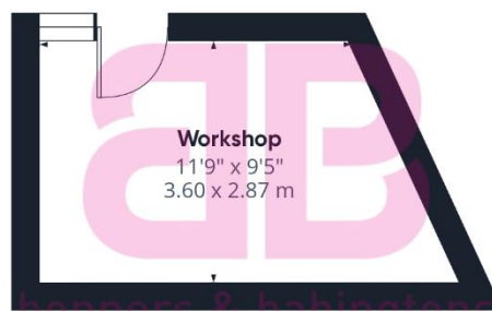
Ground Floor Building 3

Approximate total area (1) 1574.45 ft 2 146.27 m 2