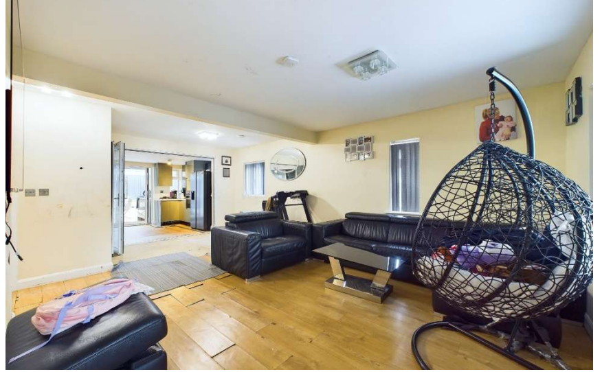
EPC – G Council Tax Band – D

Bolter End is a hamlet approximately 5 miles to the west of High Wycombe, and 5 miles to the North of Marlow. There is an abundance of walks and bridleways in the vicinity, and local hostelries and amenities are a short drive away in the village of Lane End. There are excellent rail links into London Marylebone from High Wycombe, and the M40 junction 4 and 5 are a 10 minute drive away.