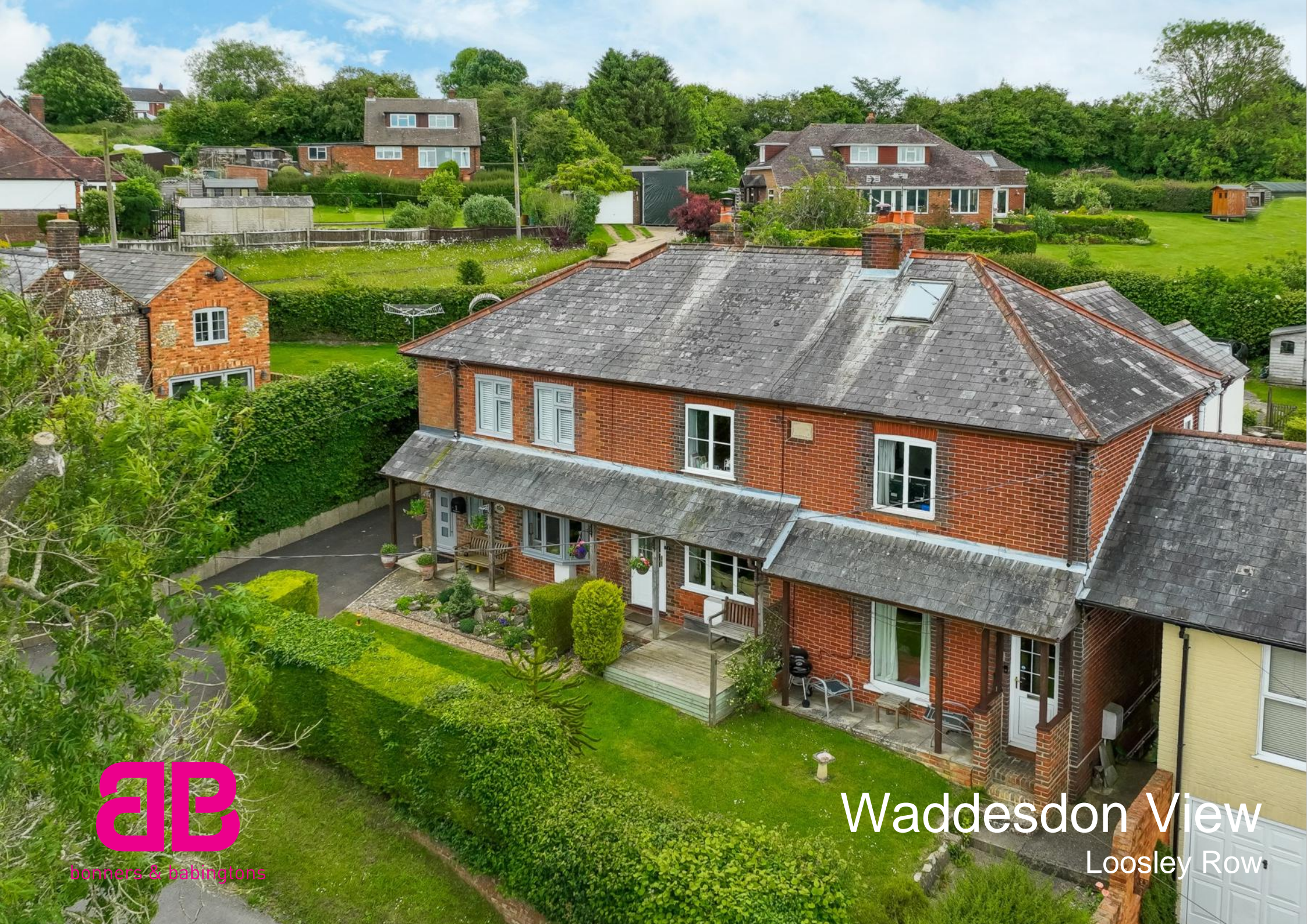
Waddesdon View Loosley Row