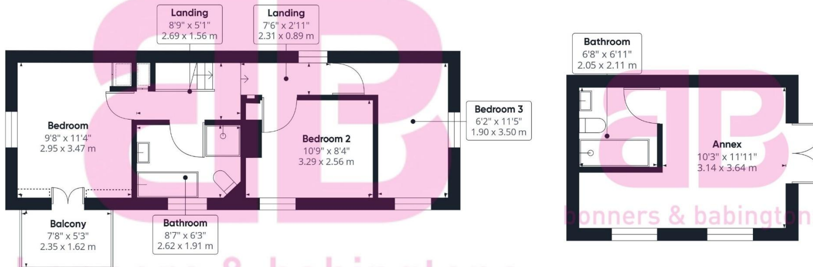
Ground Floor Building 2

Approximate total area (1) 1210 sq. feet 112.4 sq. metres