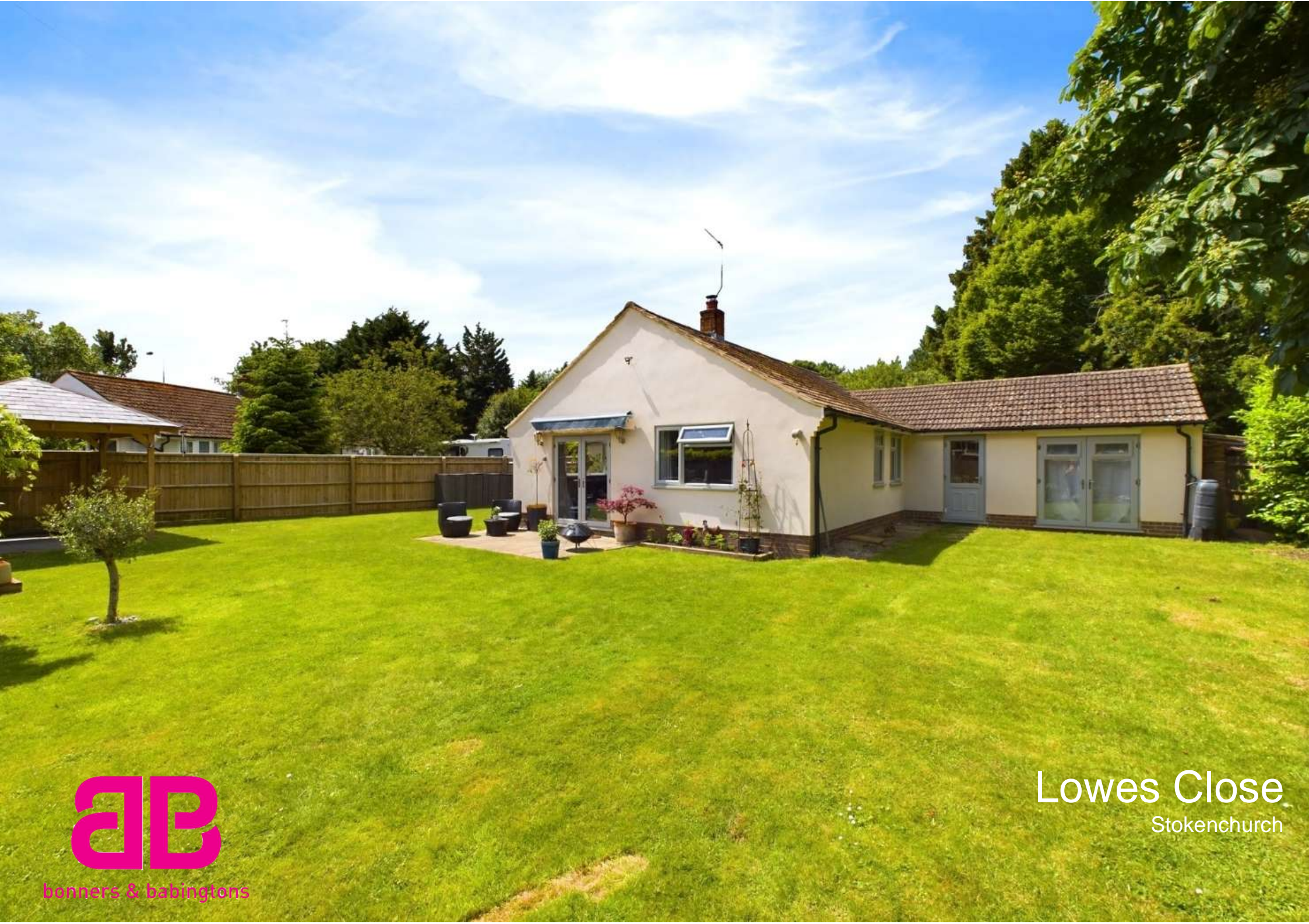
Lowes Close Stokenchurch